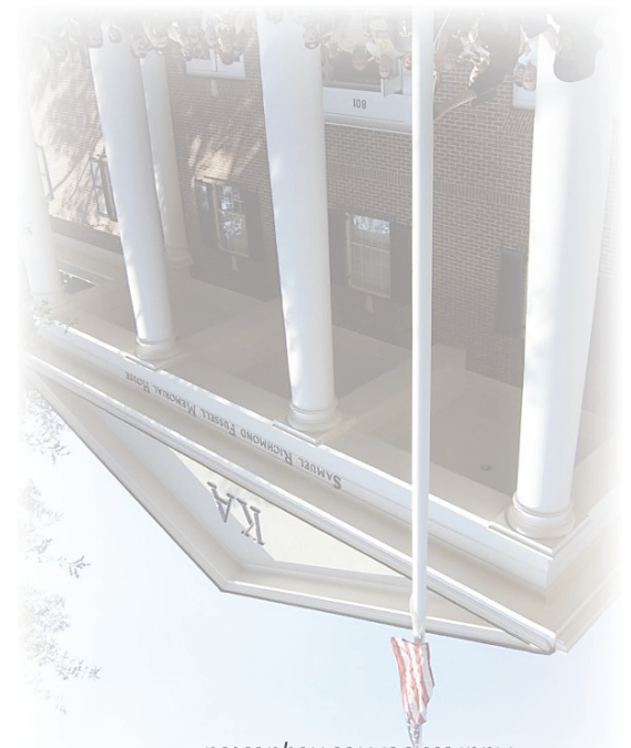
Address Service Requested