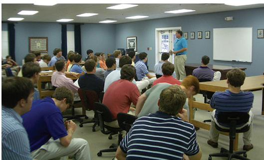
Photo of Knight Commander speaking to the Chapter.